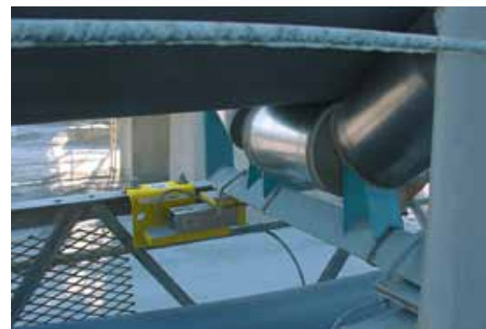
BEMP™ Belt Scale in an aggregate industry installation.

Schenck INTECONT® Plus and DISOCONT® Controllers can also be used with BEMP™ Belt Scales. For additional information on controls, weighfeeders, solids flow meters, vibratory screens, static bin weighing systems, or in-motion truck / train weighing systems, contact Schenck Process.