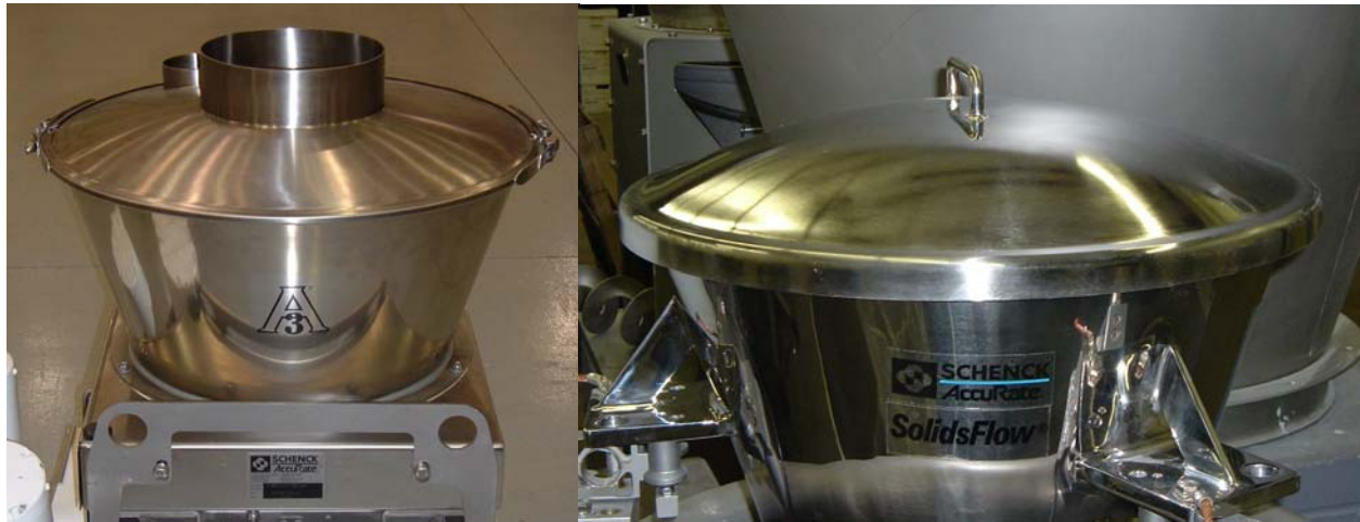
Figure 9: Domed hopper covers