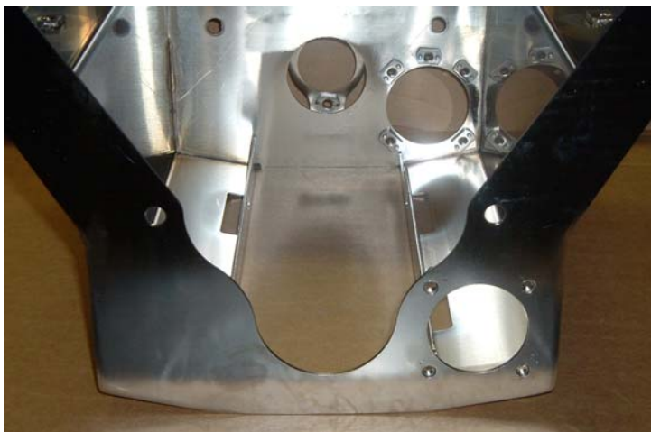
Figure 8: Feeder mainframe with bottom surface designed for watershed.

In order to reduce the potential for material build-up, it is important to minimize flat horizontal surfaces on the feeder (Figure 8). These surfaces will hold material and can allow pools to form from unwanted substances dripping onto the feeder or from feeder washdown. These pools can lead to excessive bacteria and/or fungus growth, possibly leading to material contamination. Components with large, flat horizontal surfaces, such as covers, can be replaced with components designed with watershed angles to facilitate draining, preventing these problems (Figure 9).