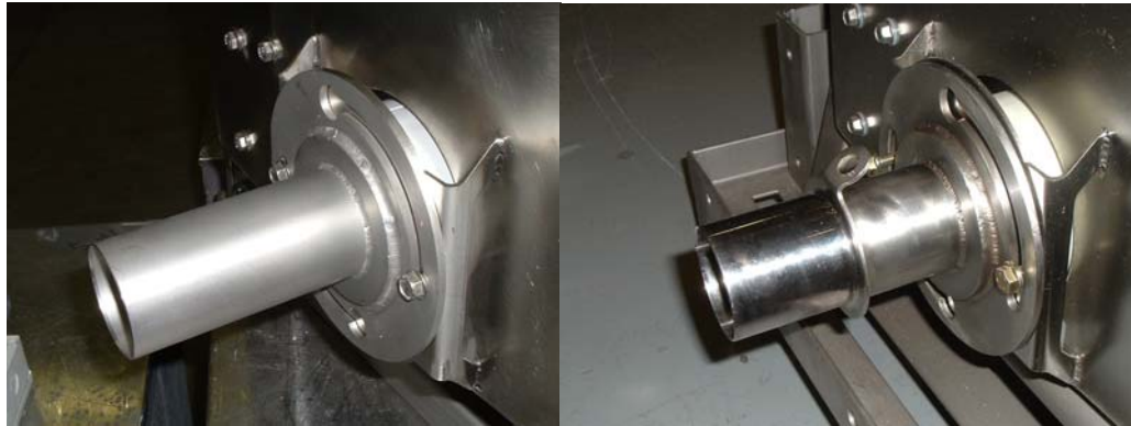
Figure 5: Industrial nozzle (left) and 3-A® approved nozzle with drip ring (right)

exterior of the feeder (Figure 5). Any material on the exterior of the feeder that travels down the discharge nozzle can not contact the material discharging from the feeder since it will drip off the end of the drip ring first.