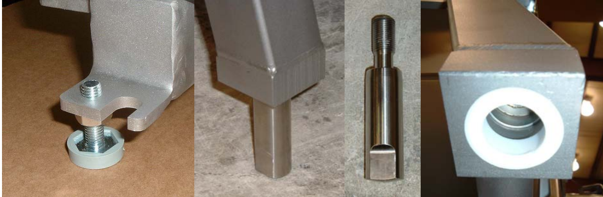
Figure 3: (left to right) Industrial leveling foot assembly, 3-A® leveling foot assembly, leveling foot, and leveling foot mount.

Bolting is not a preferred method because it creates a deep crevice between the two mating parts. Wherever possible, stand-off spacers should be used to create sufficient distance between large flat surfaces to allow access for cleaning. If mating parts must be bolted, they should be easy to disassemble for cleaning and gaskets should be used to eliminate crevices. Also, threads should never be in product contact and effort should be taken to eliminate or minimize exposure (Figure 3).