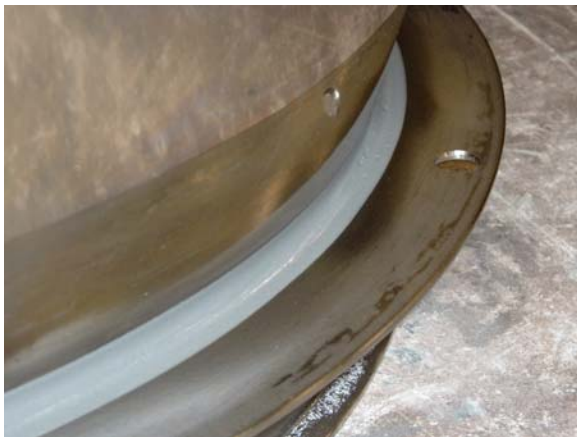
Figure 11: External crevice at base of hopper sealed with FDA approved epoxy.

Product contact materials should be FDA approved or accepted and surface finish is generally the same as the dry feeder. In addition to the basic requirements of the dry feeder, exterior cracks and crevices are sealed with either silicone sealant or epoxy (Figure 11), both of which are FDA approved. Washdown duty motors and bearings are also used in construction of the mid level feeder.