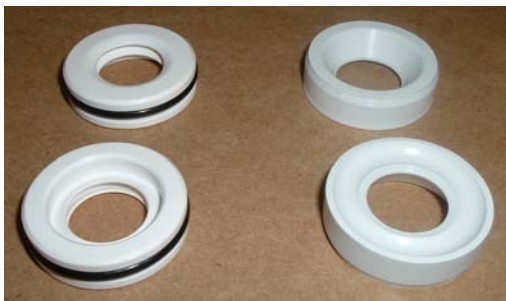
Figure 4: Industrial shaft seals (left) and 3-A® approved shaft seals (right)

Gaskets and seals are commonly used to seal the interface between mating parts. For example, gaskets are commonly used in the interface between hoppers and covers to provide a water-tight or air-tight seal, preventing contaminants from entering the product stream while allowing disassembly for cleaning or inspection. Seals are similarly used in situations where a shaft must pass from a non-product contact area to a product contact area for devices such as feed screws or internal agitation devices (Figure 4).