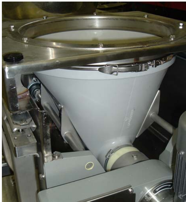
Figure 10: Low level design screw feeder

The lowest level of hygienic feeder design is intended for dry, non-perishable food products and additives (Figure 10). Typical applications include basic food ingredients such as flour or sugar which will be baked or otherwise cooked. This feeder would be placed in a dry environment and the feeder would not be washed down for cleaning. Also, clean-out of the feed hopper would generally not be required between production runs.