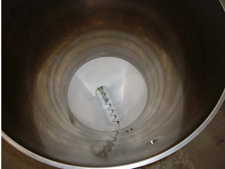
Figure 7: Screw feeder designed for mass flow.

Another feature that is desirable in hygienic feeder design is mass flow. Material hoppers that are designed for mass flow allow the first material into the hopper to flow out of the hopper first (Figure 7). This is preferred over funnel flow where the majority of the material into the hopper first will be the last out. When the first material into the hopper is the first out, you minimize the amount of time the material will sit in the hopper, reducing potential for material spoilage.