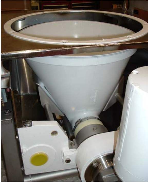
Figure 12: 3-A® approved screw feeder.

At the very least, product contact materials used for this type of feeder must be FDA approved. Often times, there will be further testing a material must undergo to achieve this type of approval, such as the lactic acid test for 3-A® approval. Typically, surface finish is required to be a certain surface roughness or smoother, such as the 3-A® Sanitary requirements mentioned earlier. Exterior cracks and crevices must also be eliminated, preferably by designing components without them, but they can be sealed if this is not possible. Special sealing requirements may be necessary, such as the use of sanitary tube fittings for discharge nozzles and auxiliary device connections. Since the regulated feeder will undergo frequent cleaning, it also features washdown duty motors and bearings.