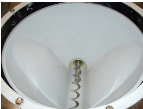
Figure 2: 3-A® approved feeder flexible hopper and feed screw

When manufacturing parts for use in a hygienic feeder, care must be taken to prevent cracks and crevices where material can accumulate. When material is allowed to sit for too long, it may spoil and lead to contamination of other material. Lingering material can also foster excessive bacteria growth. Therefore, whenever possible, a one-piece design with smooth surfaces and large corner radii to ease cleaning is preferred (Figure 2).