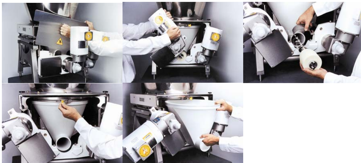
Figure 6: Non-process side feeder disassembly (chronologically left to right, top to bottom)

When designing a hygienic feeder, it is always desirable to make disassembly of the feeder as simple as possible. By eliminating the need for complete disassembly and providing the ability to disassemble the feeder from the non-process side, cleaning personnel will not be required to move the feeder or remove large components such as extension hoppers in order to clean it (Figure 6). Minimizing the amount of time necessary to clean the feeder can significantly reduce costs. Consider a feeder that can have the critical components disassembled, cleaned, and reassembled in 15 minutes compared to one that requires 30 minutes to complete the process. If the feeders are cleaned once per day, in a 10 year life span, 650 hours of cleaning will be saved by using the first feeder. Also, consider the time and money that can be saved when the cleaning personnel require less sophisticated training to clean a feeder with simpler, more intuitive disassembly.